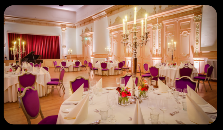
Drinks & Dinners