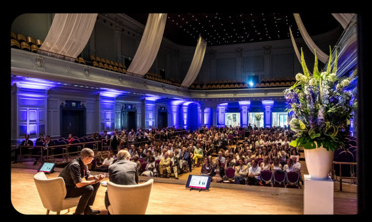
Presentations & Meetings