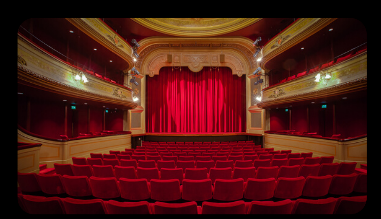
Stage & Performances