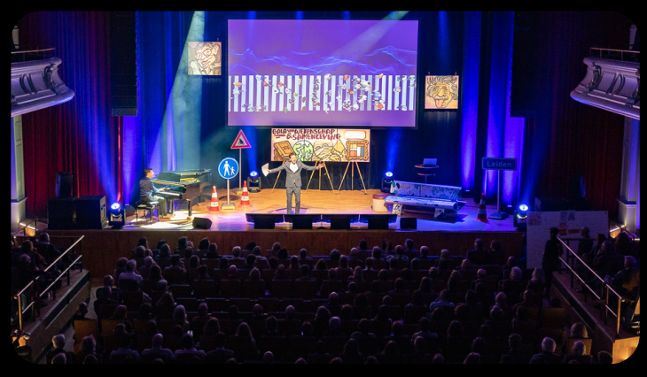
Conferences & Events

Our two monumental venues will turn your meeting, whether it is a big international conference or a company party, into a memorable experience for you and your guests. All our halls and foyers are provided with modern technology and are flexibly deployable to fit all your wishes. We are located in the centre of Leiden, so we are easy to reach.